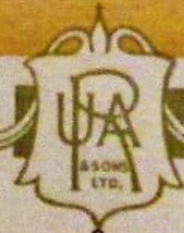
Page 8 Roll of Honour Burnhope and South Pontop Collieries