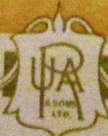
Page 26 Burnhope Colliery Served